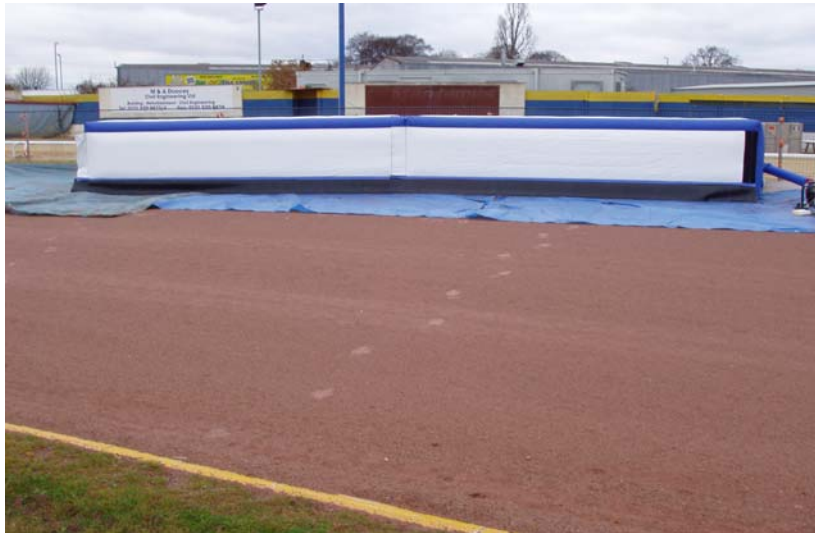
Two standard barriers joined together.

Lead In-Out Wedge Height 130cm (when inflated) Length 2.5m Width 70cm – 0cm