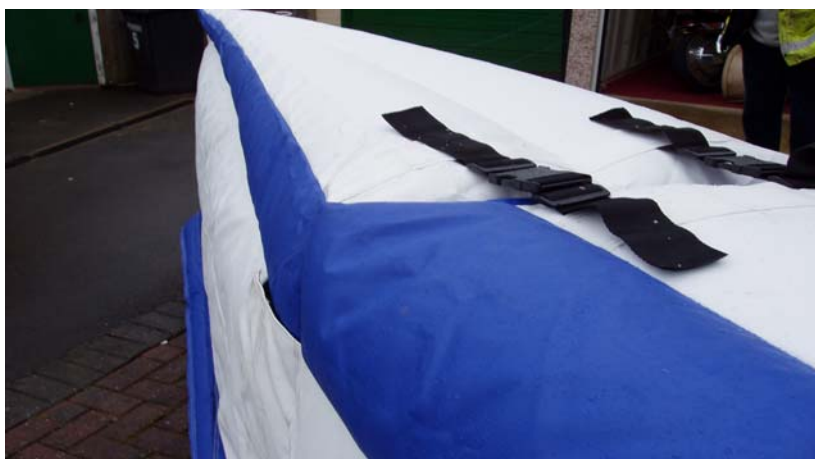
Lead In-Out wedge